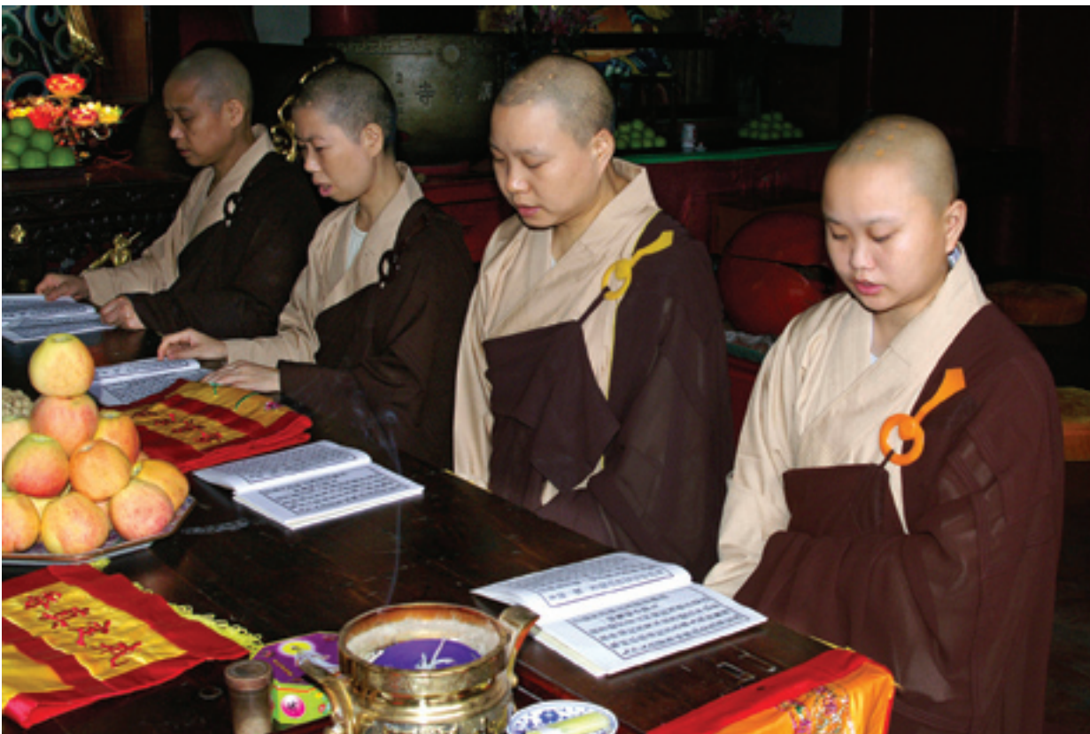
Dark brown monks