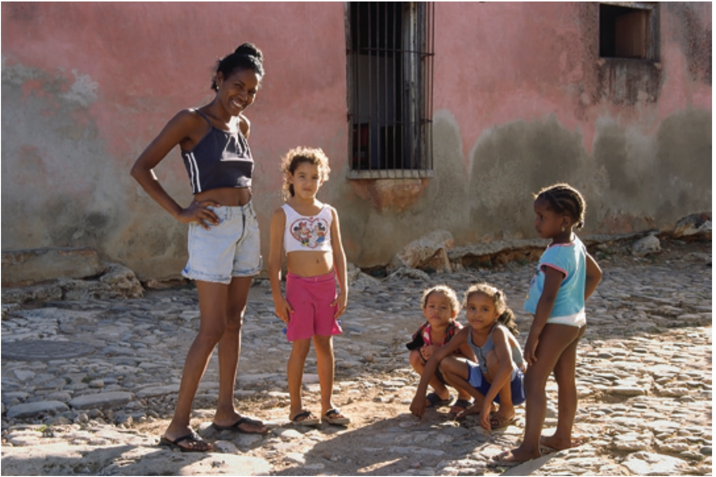
Children with mother