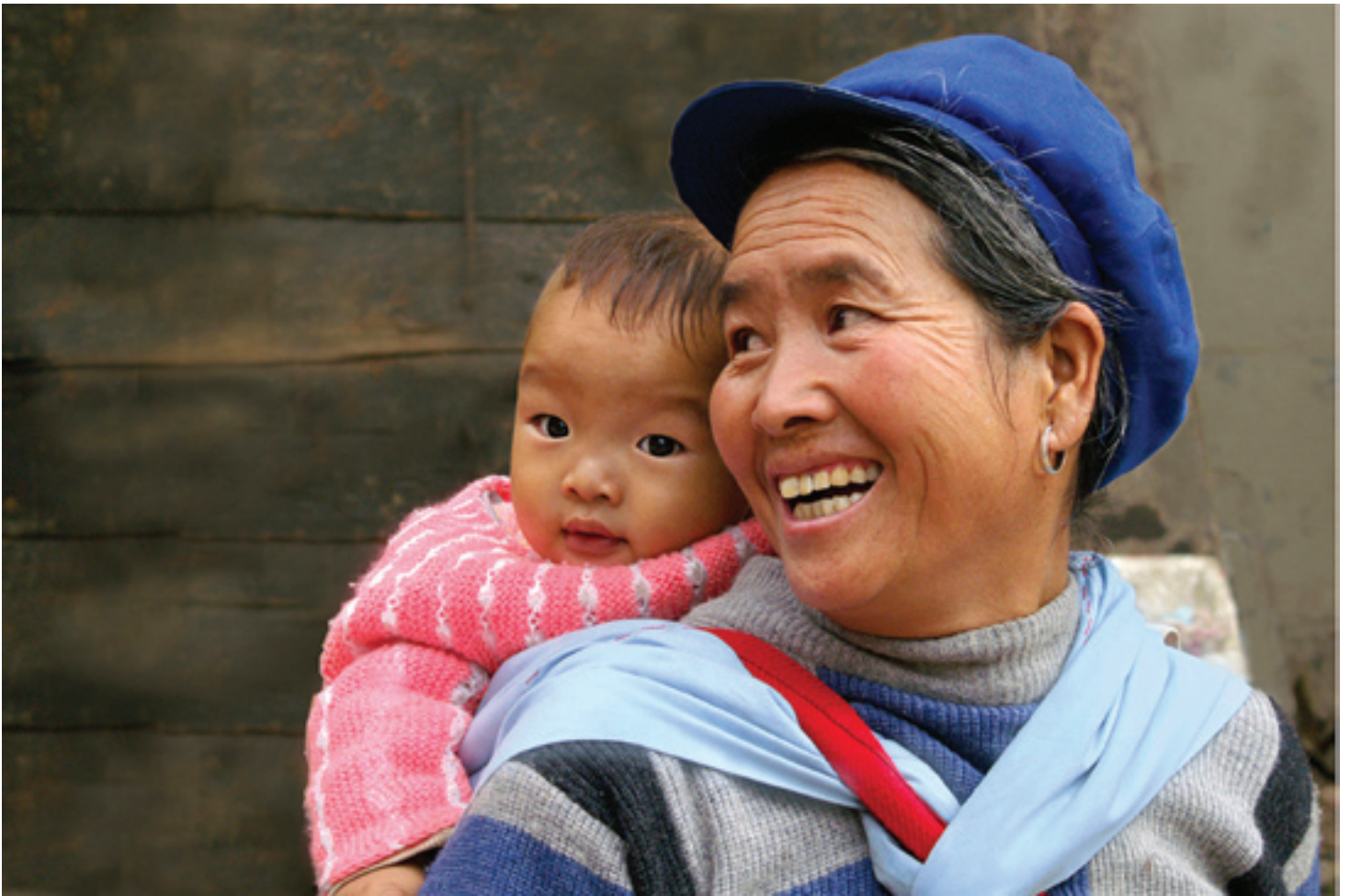
Enjoy on back