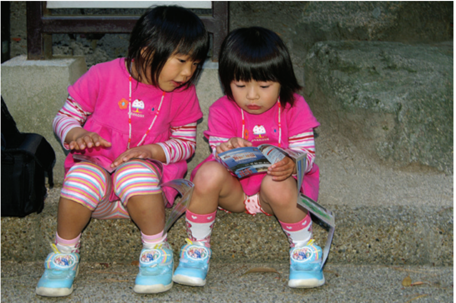
Two pink children